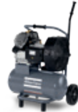
AF 30 E 24