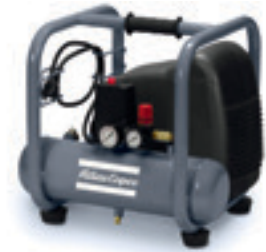
AH 20 E 6