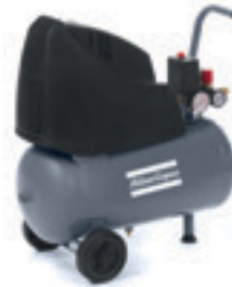
AH 15 E 24