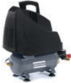
AH 15 E 6