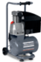
AF 20 E 10