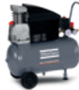
AF 20 E 24