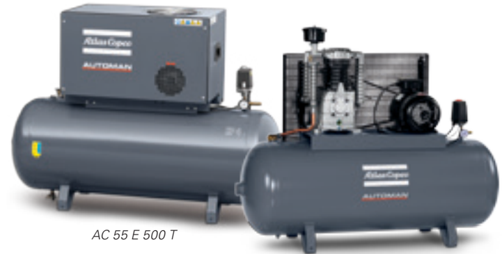
AC 55 E 500 T