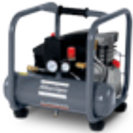
AF 20 E 6