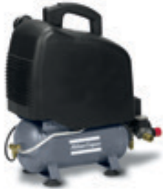
AH 10 E 6

AH series oil-free compressors are designed for a variety of applications. With no oil to replace and with the electric motor flanged to the compressor block, maintenance is reduced to the absolute minimum. Their all-aluminium, low-weight construction makes them the ideal choice when a smaller amount of compressed air is sufficient. They can be laid flat for transport.