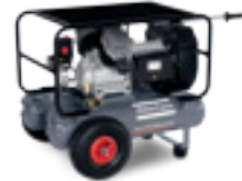
AF 30 E 22