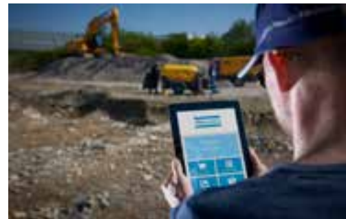
Through power connect app, quick access to view and order the relevant spare parts.