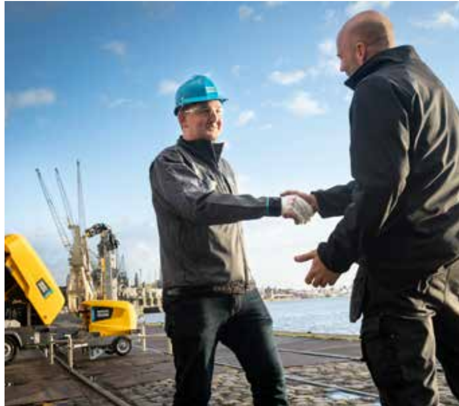
Atlas Copco ensures maximum uptime of your equipment. With the cold weather option, the compressor service interval of the XAS 188 increases from 1000 hours to 1500 hours or 2 years.

Service is a crucial part of the lifetime of a compressor. With service, you can guarantee the uptime of your compressor, while protecting your investment. On the other hand, service should take as little time as possible, so you maximize your uptime.