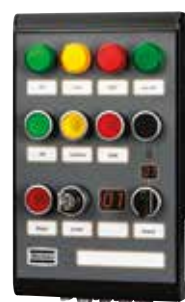
Operator panel Advanced