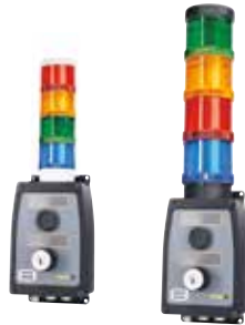
ESL-04 Compact and ESL-04 Standard

Higher quality can be achieved by giving audio and/or visual feedback about the assembly process to the operators. Time and costs can be saved by reducing reworking and avoiding faulty products leaving the production line. For feedback use Atlas Copco's Stacklights.