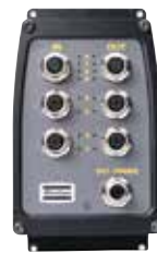
I/O expander sealed