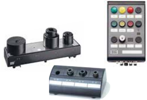
Selector 4, selector for Large Sockets and Operator Panel Basic

Productive assembly lines demand efficient operators. These should be supported with appropriate tools providing feedback for all actions. This will save time changing program settings and when performing reworkings in station. For variance support use Atlas Copco's Selectors and Operator Panels.