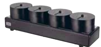
Selector for large socket