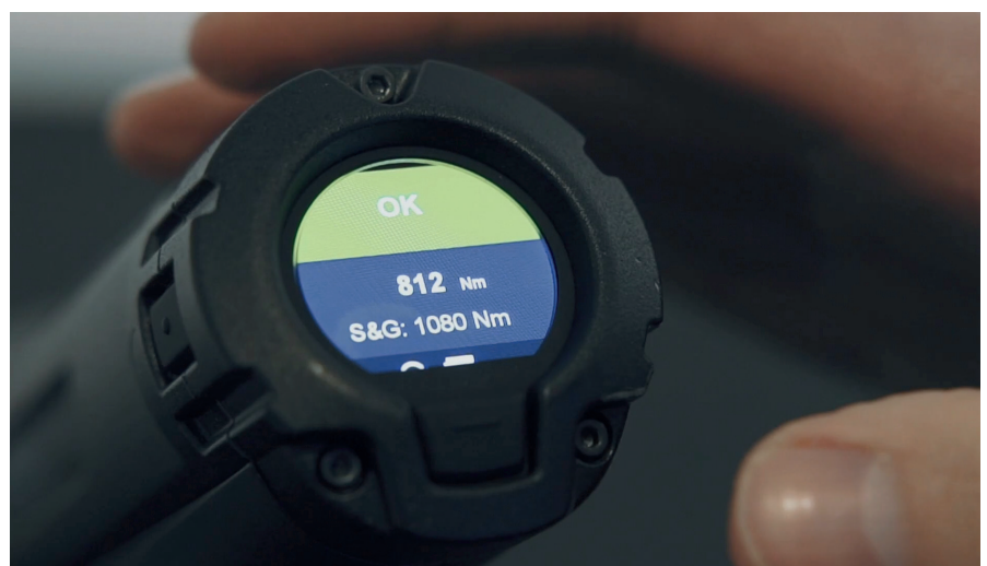
Feedback on tightening status allows operators to address problems at source so that processes can be completed right first time.

When we talk about smart tooling, we talk about tools that have sensors or intelligence built in, that can measure or monitor an operation or a process and can give the operator feedback that a job has been done correctly, and can provide a digital record of that result. However, smart bolting is not only about using smart tools, but is about working in smarter way, by introducing solutions that can either reduce process time, or make the process easier and safer for the operators to do their work. This results in less mistakes, higher output and happier technicians.