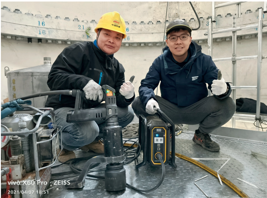
Tensor Revo nutrunners can reduce bolting process time by more than 50%

When talking to Wind OEMs or contractors about their challenges when it comes to bolting work in the field, we hear repeatedly the same messages: