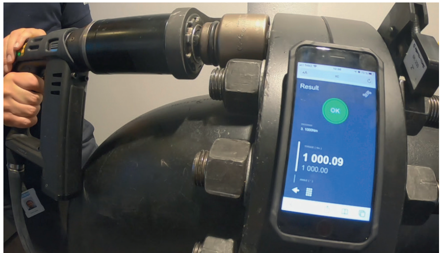
Tools connect to 'any smart device' so no need for complex and costly control panels.

One solution to address all these points is to use intelligent battery nutrunners, (not to be confused with battery impact wrenches). Battery nutrunners effectively remove the need for hydraulic pumps, and so eliminate the need for heavy lifting completely, and also remove any tripping hazards because there are no cables or hoses in the system.