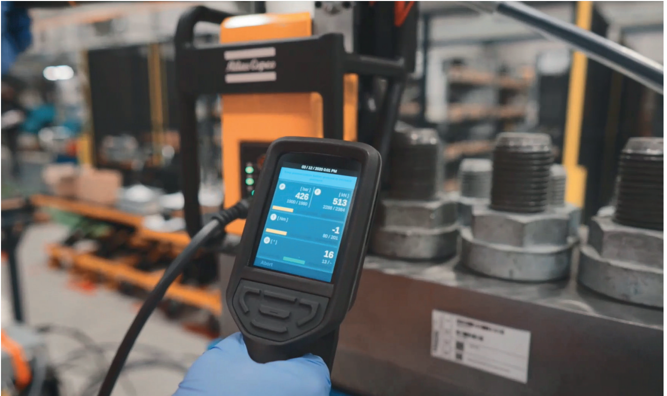
Visual feedback on tools and devices ensures that the operator gets feedback without need for external devices or gauges.

For the most part this is strictly adhered to, but there are occasions that specific factors can have an impact. Time pressure, changes in contractors, material defects, equipment failure, for example all could potentially result in process steps being done incorrectly or even missed completely.