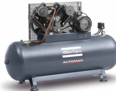
AT 55/AT 75/AT 100