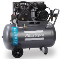
AT B2-100/AT B3-100