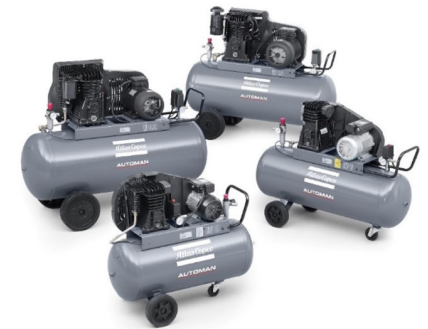
AB 40/AB 55/AB 75/AB 100