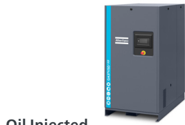
Oil Injected Rotary Screw