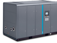
Oil Free Rotary Screw/Tooth