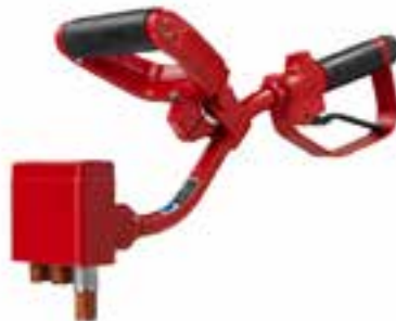
CP 0006 SVR