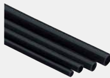
PA pipe - black