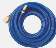
High pressure hoses