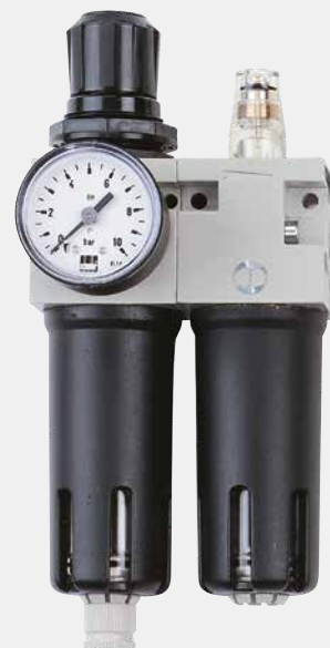
Filter regulator - Lubricator