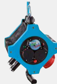
Power and air supply unit