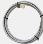
PA rolled pipe